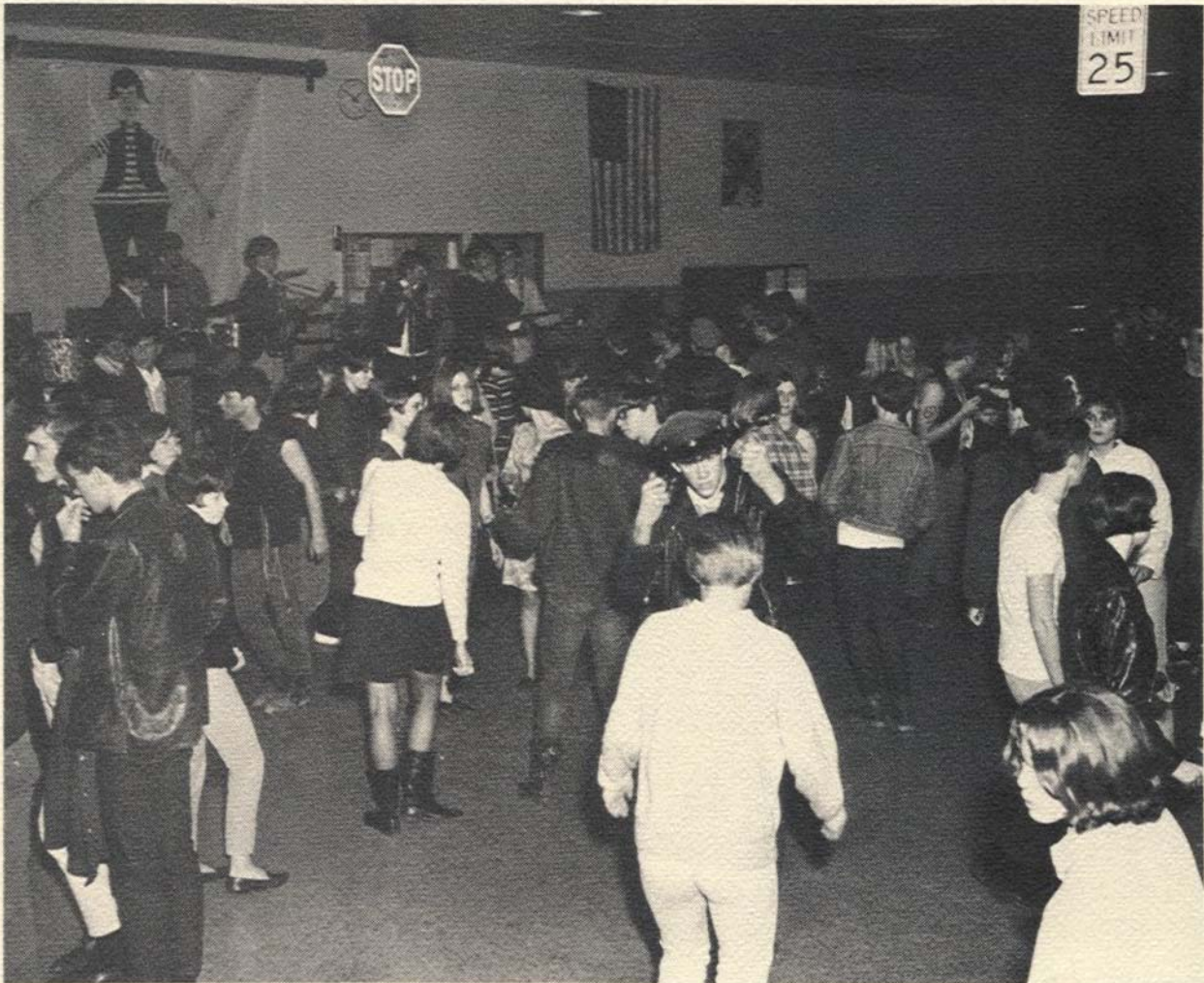
Seniors were dressed in style as they danced to the sounds of the "Something Who" at "Harley Hood."